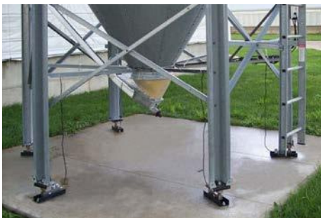
Economical, precise feed inventory management