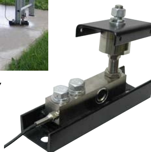
Load Cell handles up to 10,000 lbs. (4,500 kg) per feed bin leg