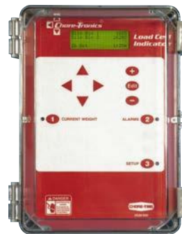
Load Cell Indicator Control is simple to operate for monitoring feed bin weights

Chore-Time's Feed Inventory System provides an economical means for managing and monitoring feed stored in feed bins on the farm. Producers easily check feed bin weights by using a read-out screen. Getting precise weights aids in better managing feed inventories and helps to prevent costly out-of-feed events. Designed to work as a stand-alone system, the feed inventory system also can be connected with Chore-Time's popular C-CENTRAL™ Software to provide remote location and multiple house monitoring.